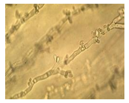
Fig. 3. Aureobasidium sp.