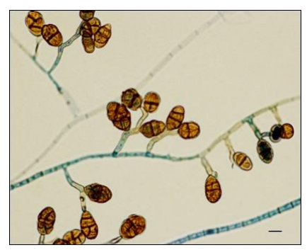
Fig. 1. Ulocladium sp in the microscopic examination.

Cladosporium, Aureobasidium and Alternaria were as 38.7%, 30.2%, 10.7% and 6.4% respectively. Also 13.9% were as sterile hyphae. The following table 1 shows the abundance of fungi studied here, regarding the source.