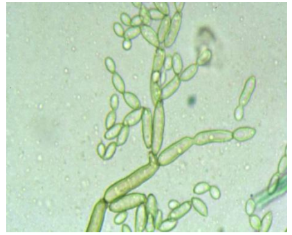
Fig. 2. Cladosporium sp.